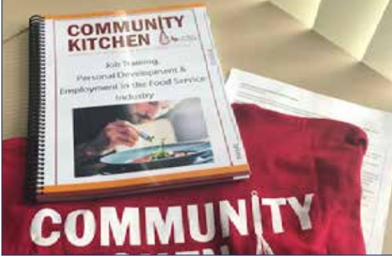
Youth Workforce Development Initiative