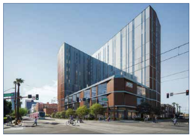
Residence Hall and Entrepreneurial Center

Arizona State University (ASU) secured $61,810,000 in bond financing to build a new student residence hall on the ASU Downtown Phoenix campus at the southwest corner of Fillmore Street and First Avenue. ASU plans to use the bond proceeds to finance construction and furnishing of the new residence hall. The building will be an integrated residential and academic complex initially known as the Downtown Phoenix Residence Hall and Entrepreneurial Center.