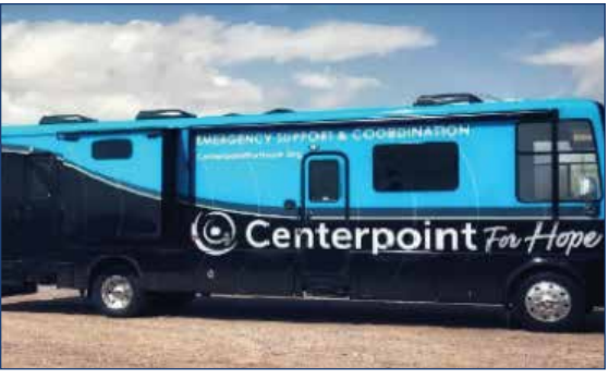
Trauma Informed Vehicle