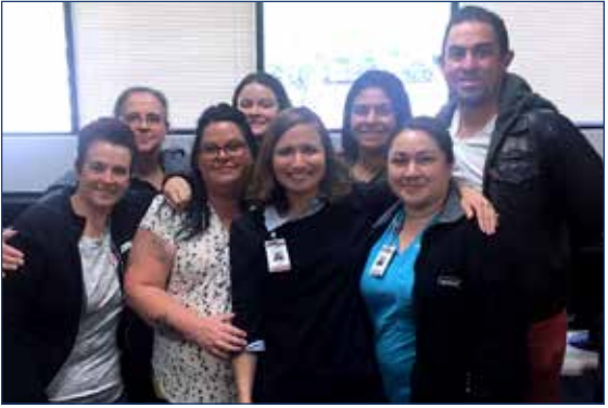
Bridge to Success in Healthcare Careers