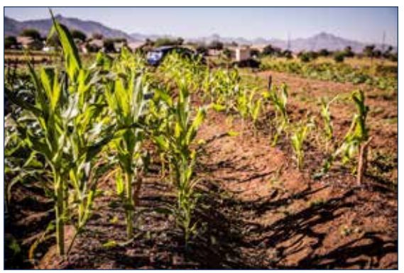
Spaces of Opportunity