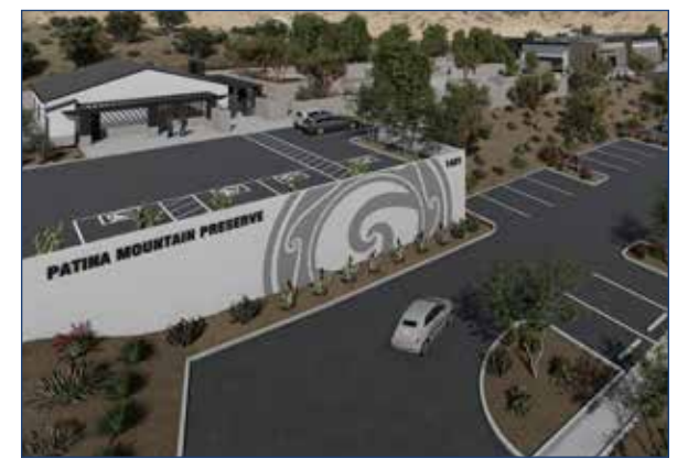
Rendering of the Patina Mountain Preserve entry

dining, nine ADA single-person restrooms, billiards and media rooms, as well as outdoor spaces including two large multi-purpose patios, a dining patio, and a garden walking path.