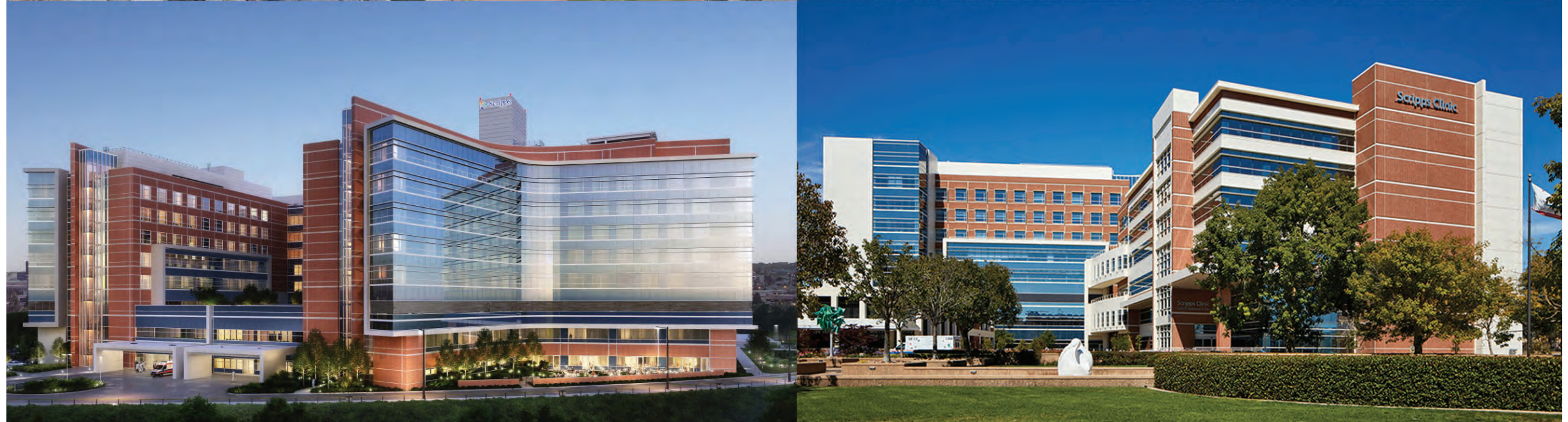
SAN DIEGO, CA