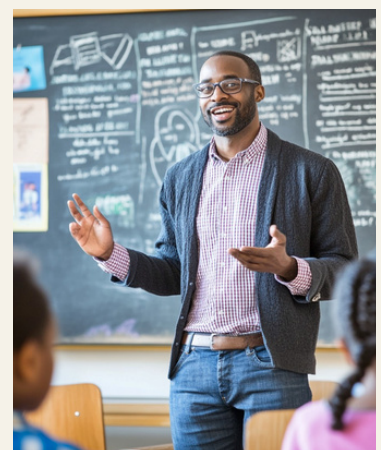
Power of WHEN Well-being Program

WHEN reached more than 1,230 educators in the Phoenix Union High School District and other local Title I schools throughout Maricopa county by providing the Power of WHEN® Well-being program, which includes one-on-one coaching, practical wellness knowledge and well-being self-assessment activities to reduce stress, enhance productivity and attain work-life balance. (continued on page 7)