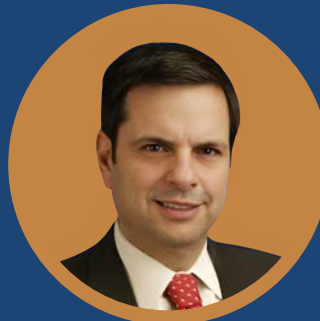
TREASURER PHIL GORDON FORMER MAYOR OF PHOENIX