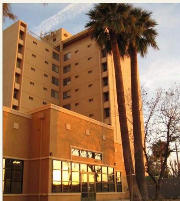
Memorial Towers Senior Housing Project