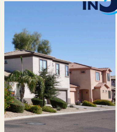
Home in Five assisted 754 buyers in 2024