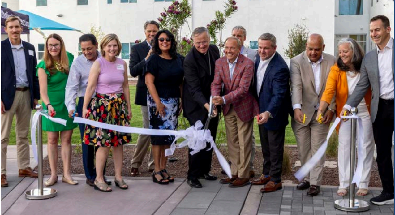
Ribbon cutting ceremony held onsite at Mesquite Terrace in May 2024.