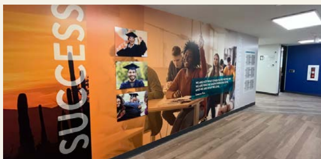
Goodwill's Excel Center

The Phoenix IDA also supports investment in strategic areas through direct and participation loans that fund projects in low-income communities or programs operated by nonprofit organizations that benefit the underserved. In 2024, the Phoenix IDA closed four loans totaling $2.25 million.